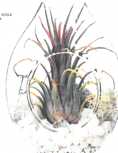
Skyline – ICICLE Air Plants

Make sure all excess water is shaken out after watering – you don't want the base of your lovely airplant to rot.